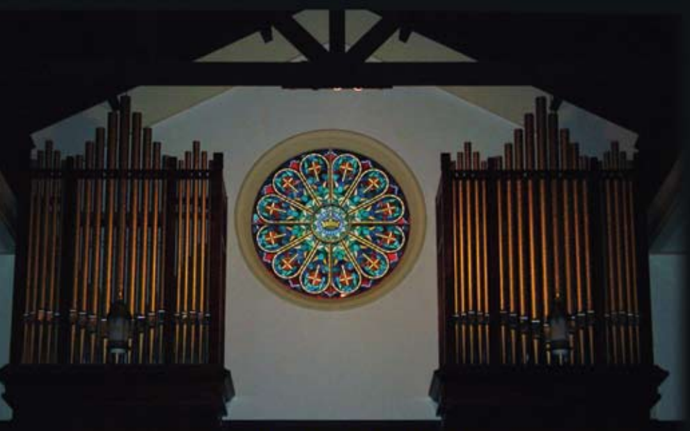
Antiphonal Organ & Rose Window